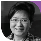
DR. KALAYA SOPHONPANICH Deputy Leader, Democrat Party, Thailand Former Minister of Science and Technology, Thailand