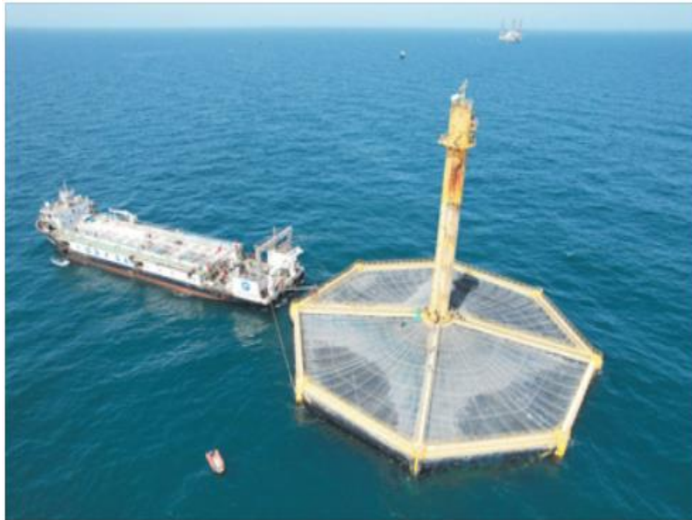
"Shenlan No. 1" platform installed in the Korea-China Provisional Measures Zone captured from the People's Daily Online. [SCREEN CAPTURE]