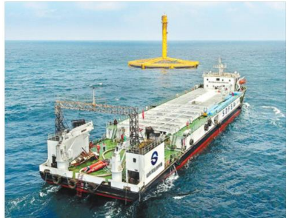
"Shenlan No. 1" platform installed in the Korea-China Provisional Measures Zone captured from the People's Daily Online. [SCREEN CAPTURE]